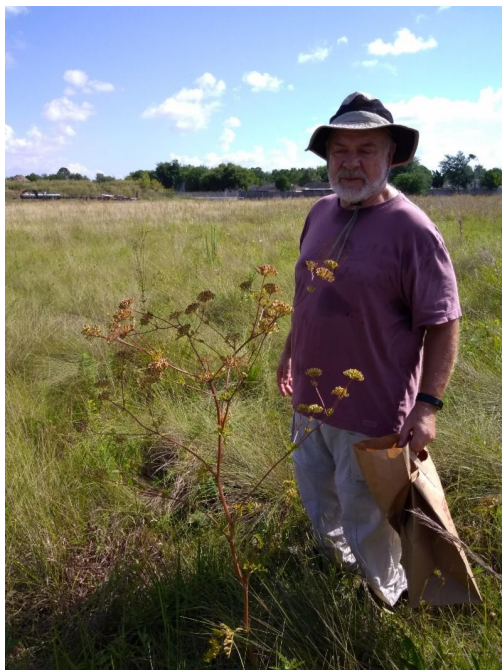
Collecting Prairie Parsley ( ) at Deer Park Prairie, June, 2018

2nd Wednesdays July - December at Deer Park Prairie Friday, July 12 on the Katy Prairie