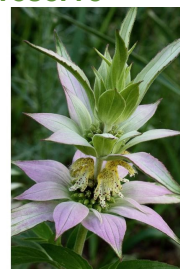
Spotted beebalm ( Monarda punctata)